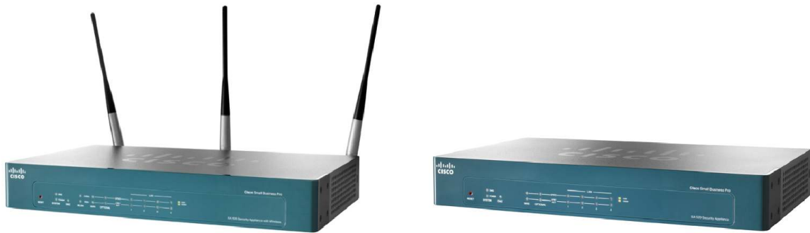
Figure 3. Cisco SA 500 Series Security Appliances, the SA 520W and the SA 520